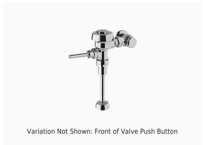
Variation Not Shown: Front of Valve Push Button